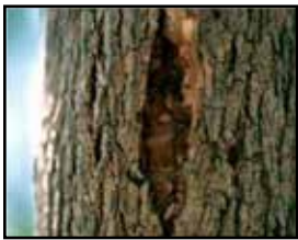
Vertical splits in the bark