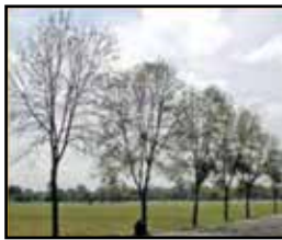
Sparse leaves