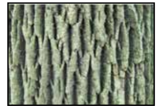
Ash tree bark has a diamond shaped furrow and a rough texture

Learn more about the Emerald Ash Borer, ash tree identification, signs and symptoms of EAB and treatment options at the following sites: