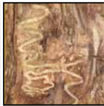
S-shaped emerald ash borer galleries under the bark

Learn more about ash tree identification and the signs and symptoms of EAB at www.arapahogov.com/2376/Emerald-Ash-Borer-EAB