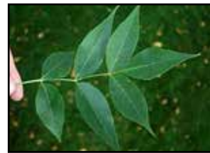
Ash tree leaves are oblong and Sharply pointed serrated edges