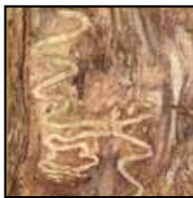
S-shaped emerald ash borer galleries under the bark

Learn more about ash tree identification and the signs and symptoms of EAB at www.arapahoe.gov/2376/Emerald-Ash-Borer-EAB