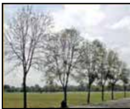
Sparse leaves